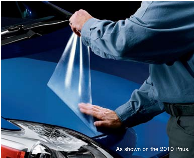
As shown on the 2010 Prius.