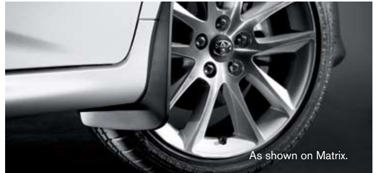
As shown on Matrix.

Help protect your Corolla's factory paint from sand, stones, insects and other road debris that can chip and scratch the finish with paint protection film. Constructed from durable, colorless urethane and nearly invisible, it can be applied to the frontal impact areas of the vehicle including the hood and fenders. Quick and easy to install, the paint protection film helps maintain a like-new appearance.